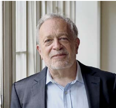
Robert Reich